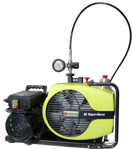
Article number: 06009