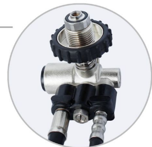
Pressure reducing valve DSPR-1