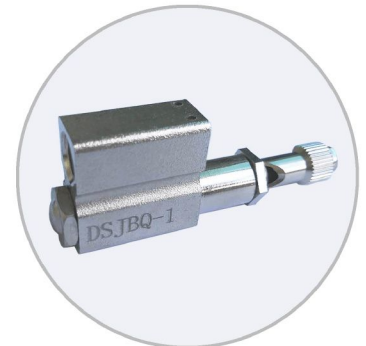
Article number: 02076

The gauge range is 0-40MPa, the working pressure of the cylinder is 27-30MPa and the alarm pressure 5-6MPa is marked with green and red areas, respectively. When the pressure of the cylinder drops to 5\pm 0.5 MPa, the residual gas alarm will emit a continuous sound of 90dB to remind the user that the gas source will be used up and it is necessary to evacuate the site as soon as possible. For a cylinder with a volume of more than 5L, the gas source for the cylinder can be used by the wearer for 5-8 minutes.