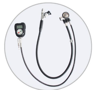
Medium pressure tube