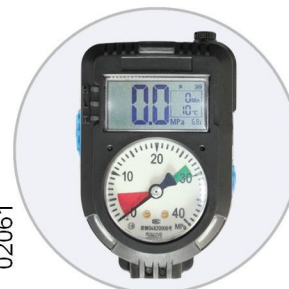
Alarm whistle DSJBQ-1