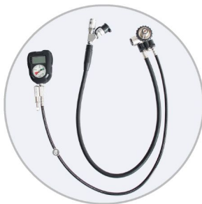
High pressure tube

Features: Scientific design, safe decompression, selection of high quality stainless steel, anti-oxidation, flame retardant, impact resistance, pressure gauge 24 hours waterproof.