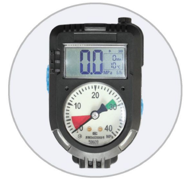
Article number: 02061

Both the pointer and the screen of the electronic pressure gauge can show the cylinder pressure. At the same time, the data is transmitted to the HUD via Bluetooth to light up. Effectively avoid delaying the rescue time by looking down at the pressure gauge and affecting attention.